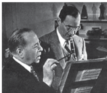
Taught Benny Goodman and arranged music for his concerts and recordings