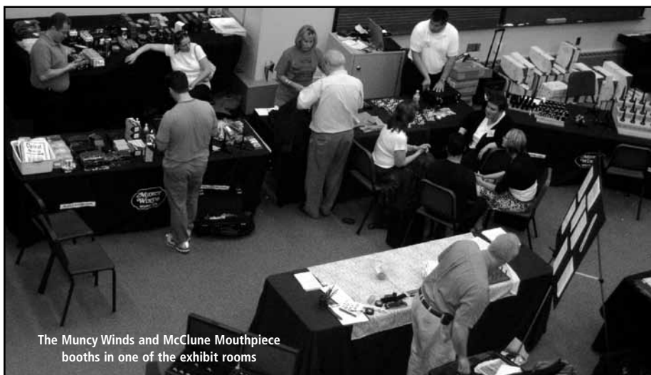
The Muncy Winds and McClune Mouthpiece booths in one of the exhibit rooms

MANDARIN - SZECHWAN - HUNAN - CANTONESE - ASIAN STYLE NOODLES